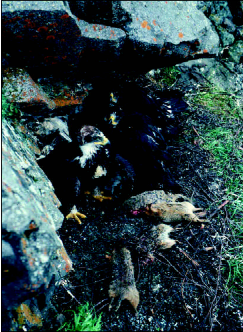
Golden eagle productivity in Denali is influenced by spring prey resources. Triplet eaglets are common only in years when prey resources are abundant.

park managers, scientists, and the public with comprehensive information about the nature and condition of the bird resources placed under our stewardship. The plan will outline what we know about Denali's birds, describe our existing studies and conservation efforts, and identify the conservation and research needs of Denali. It will also include strategies for securing funding for projects and developing new partnerships with other scientists.