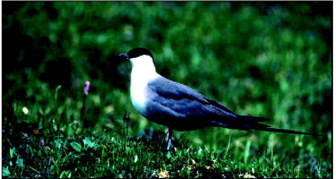
The agile long-tailed jaeger graces Denali's skies and tundra in the summer.

and black-backed woodpeckers, and the northern flicker. All but the northern flicker are year-round residents. Black-backed woodpeckers are rather rare and usually occur in areas after a wildfire.