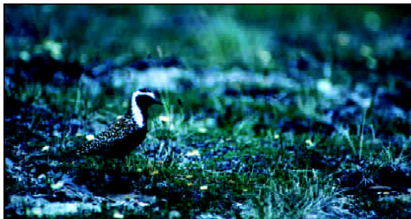
The loud haunting calls of the American golden plover are commonly heard in alpine areas of Denali in the summer.

Ruffed and spruce grouse and all three species of North American ptarmigan (willow, rock, and white-tailed) are year-round residents in Denali. Grouse are found in the forested regions of Denali. The smallest and least abundant white-tailed ptarmigan is usually found at higher elevations. The larger and more abundant rock ptarmigan is a bit easier to find and occurs in alpine tundra. The most common and largest of the three species, the willow ptarmigan, occurs in shrubby areas, usually at or below tree line. All three species flock together in winter.