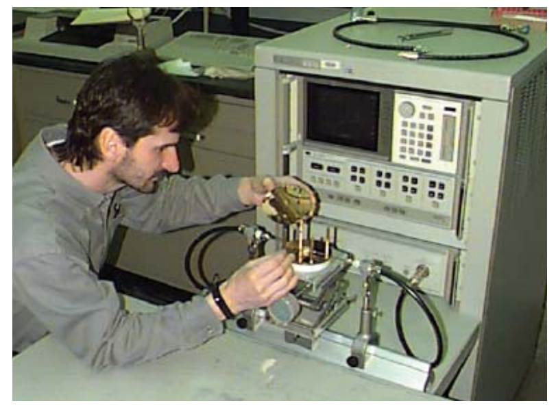
High-frequency characterization of materials and prototype devices developed in the CDS.