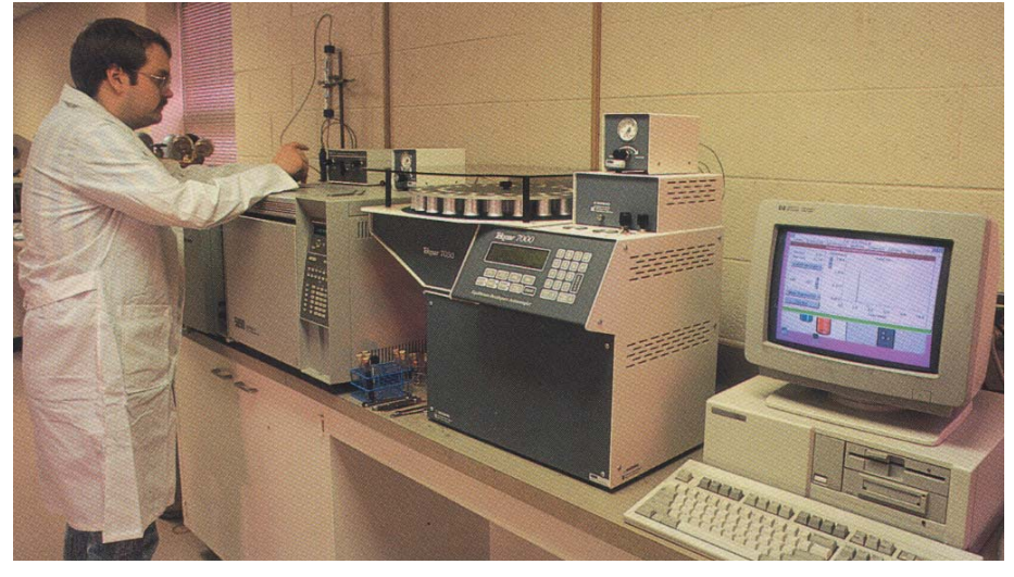
A student prepares a sample for analysis. The water content of a water-based coating will be analyzed using a Gas Chromatograph/Mass Spectrometer Head-Space Analyzer at EMU.