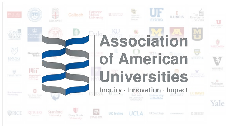
AAU Presidents and Chancellors Meeting