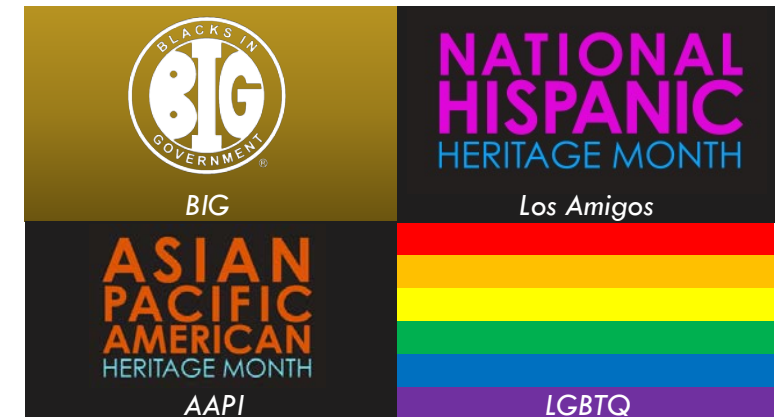
NSF Employee Resource Groups