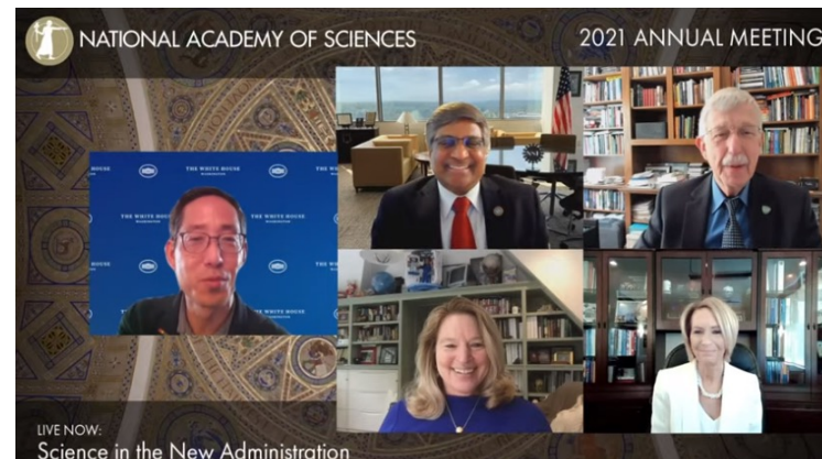
NAS Annual Meeting: Science in the New Administration