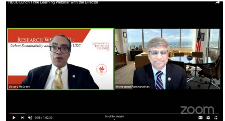
HBCU Lunch Time Learning Webinar