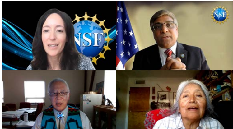
Town Hall with Tribal Nations