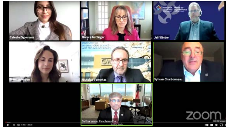
Bromley Memorial Event