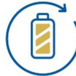
Advanced Energy & Industrial Efficiency Technologies