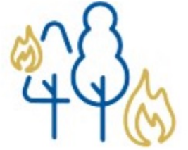
Disaster Prevention & Mitigation