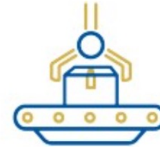
Robotics & Advanced Manufacturing