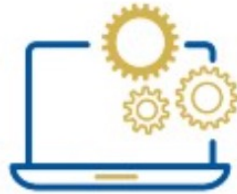
Advanced Computing & Semiconductors