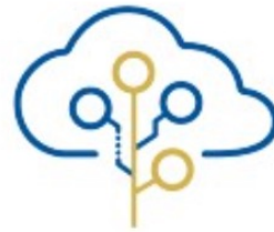
Cyberinfrastructure & Cybersecurity