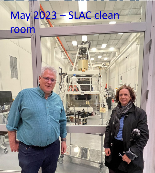
May 2023 – SLAC clean room