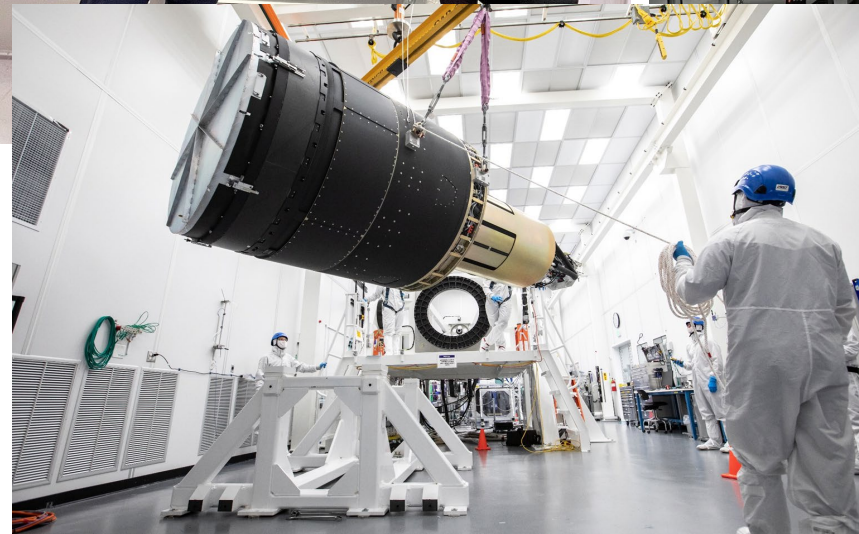
Camera calibration optical bench (CCOB) under the zenith-pointed camera in dark box