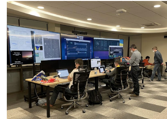
Test data is getting sent from Chile to the USDF in SLAC

AuxTel is back in operation; being used for data management and system commissioning. Data is being analyzed at the Rubin Science Platform at the USDF in SLAC